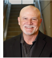
Bill Haley Member