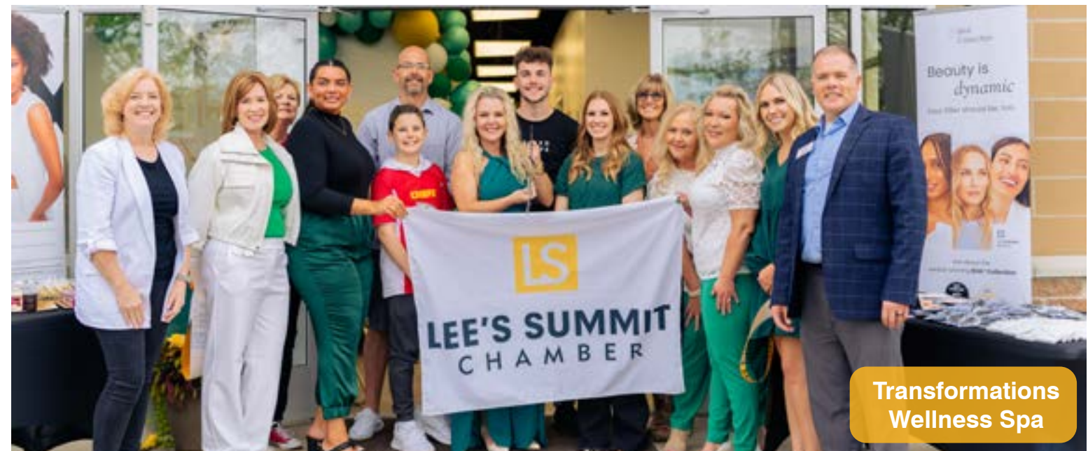
Transformations Wellness Spa