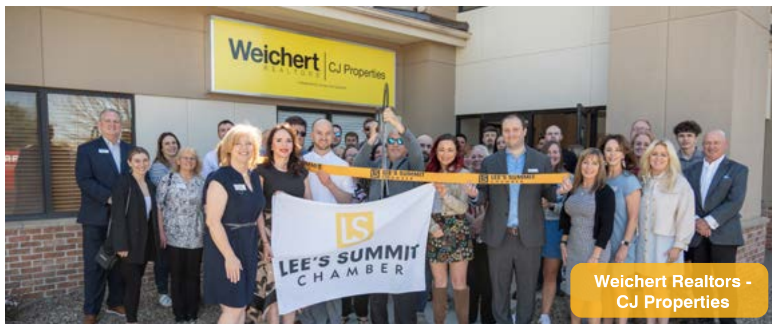
Weichert Realtors - CJ Properties

Reinforcement, Reinforcement, and Reinforcement.