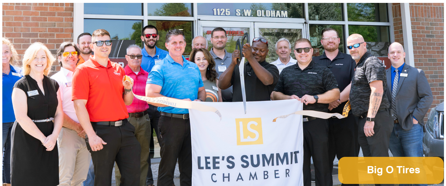
Big O Tires