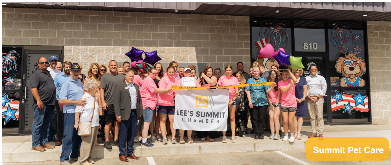
Summit Pet Care