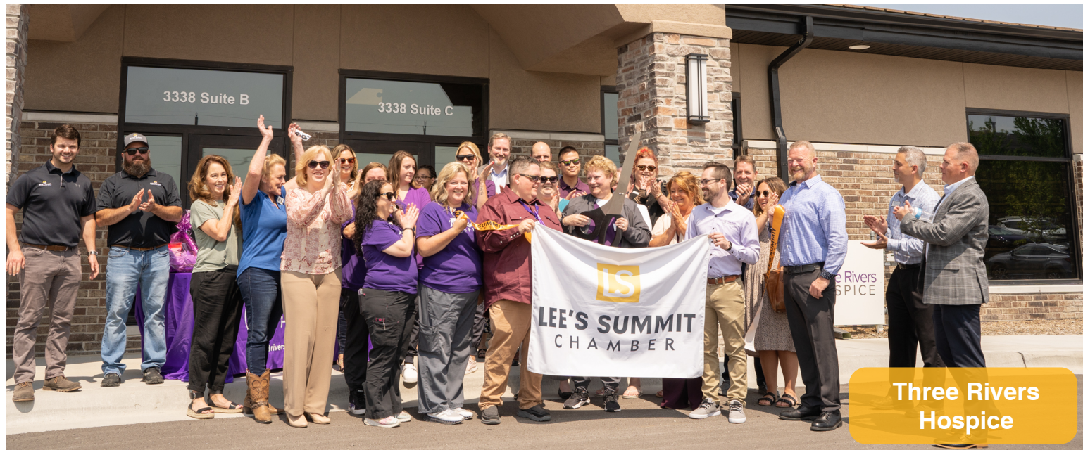
Three Rivers Hospice