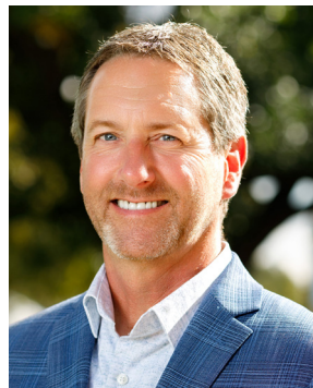
Jarvis Sackman Hillcrest Transitional Housing