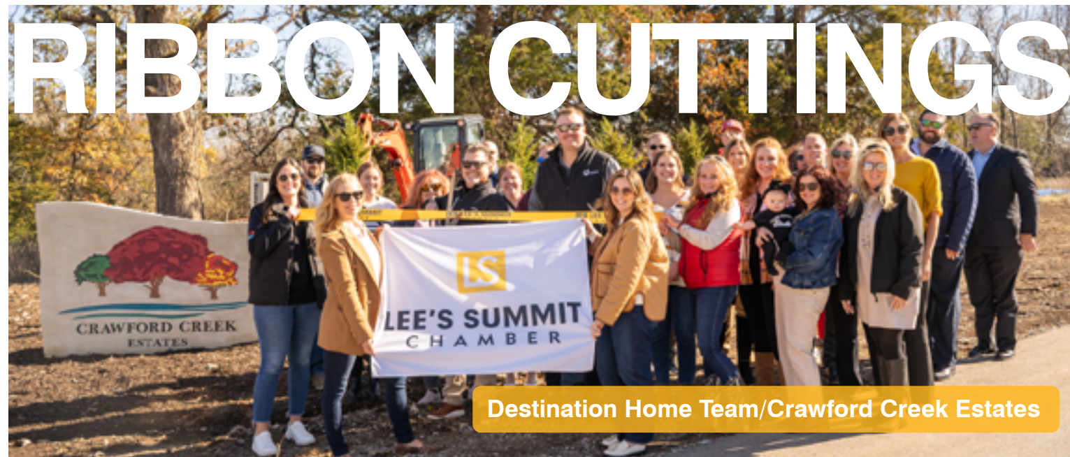
Destination Home Team/Crawford Creek Estates