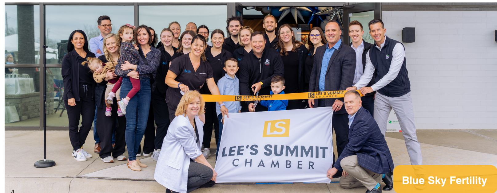
Blue Sky Fertility